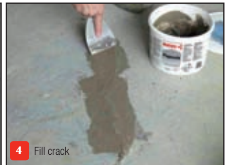
4 Fill crack