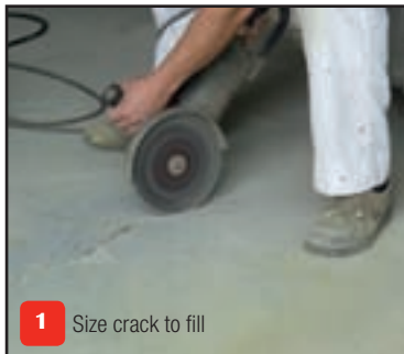
1 Size crack to fill