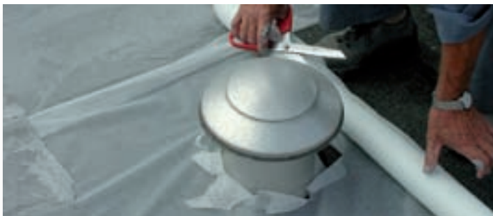
Extra mechanical strength can be obtained by using reinforcement fleeces.

Available in almost any colour upon request. Note: Minor differences between above printed and supplied colours are possible due to printing limitations.