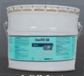
Dacfill SB - Topcoat