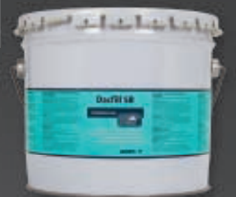
Dacfill SB - Embedment coat