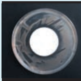
Paint without BACTRON™

Bactericidal action can be quantified and shown graphically. This graph compares the 'kill' rate of Biosan® containing BACTRON™ (blue) with a control (red) when challenged with Staphylococcus aureus . It uses a logarithmic scale to show that Biosan® with BACTRON™ kills 99% of bacteria during the initial 48 hours. After 7 days the bacteria cannot be detected on the BACTRON™ protected sample whereas significant numbers of potentially pathogenic (disease causing) bacteria are still surviving on the unprotected coating.