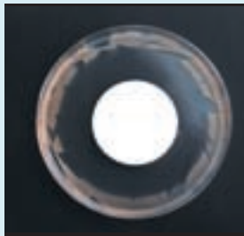
Paint with BACTRON™

Biosan® products are formulated using unique modern water based technology. When used in accordance with instructions, Biosan® is entirely safe. All Biosan® products are classified as non-flammable. Most Biosan® products are rated Class 0 surface spread of flame based on BS 476: Part 6 & 7.